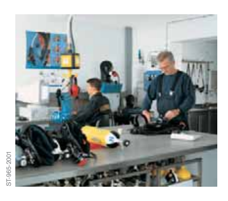
Servicing for safety

PERSONAL PROTECTIVE EQUIPMENT IS YOUR LIFE INSURANCE WHEN YOU ARE EXPOSED TO EITHER FIRE, SMOKE, HEAT AND CHEMICALS. SO IT MUST BE READY FOR USE AGAIN, IN THE RIGHT PLACE AND CONDITION, AS QUICKLY AS POSSIBLE. DRÄGER SAFETY SUPPLIES WORKSHOP SYSTEMS DESIGNED TO YOUR INDIVIDUAL NEEDS WHICH ENSURE EFFICIENT WORKFLOW, GREAT CARE AND SERVICING OF YOUR PROTECTIVE EQUIPMENT.